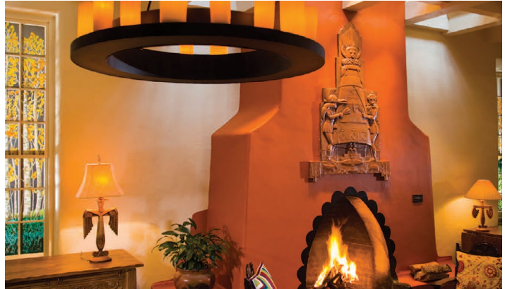
La Fonda on the Plaza, Santa Fe