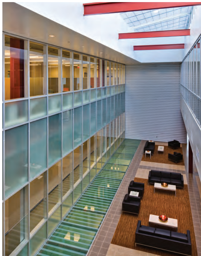
Staff and law enforcement personnel share a central atrium lobby