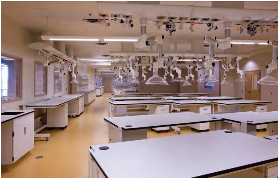
Left, Bottom Left and Bottom Right: Many labs feature direct/indirect lighting and extensive use of occupancy sensors with manual override