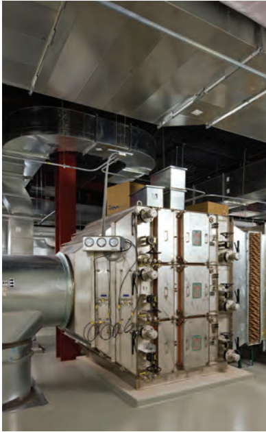
Above: HEPA filter plenum for efficient cooling of clean rooms

Constructing a sustainable building was both a priority and a challenge for the NMSL design team because a significant number of processes at the facility are extremely energy and water intensive. During the preliminary stages of design, it became clear that huge amounts of outside air would be required to provide make-up for the large amount of exhaust created by the laboratories. The design team targeted the make-up air as an opportunity to significantly reduce the energy consumption required to heat and cool the ambient air. This resulted in the selection of heat recovery of the exhaust air stream to preheat outside air using run-around coils. Also, to reduce cooling loads, direct evaporative coils can be used during periods of low ambient wet bulb conditions.